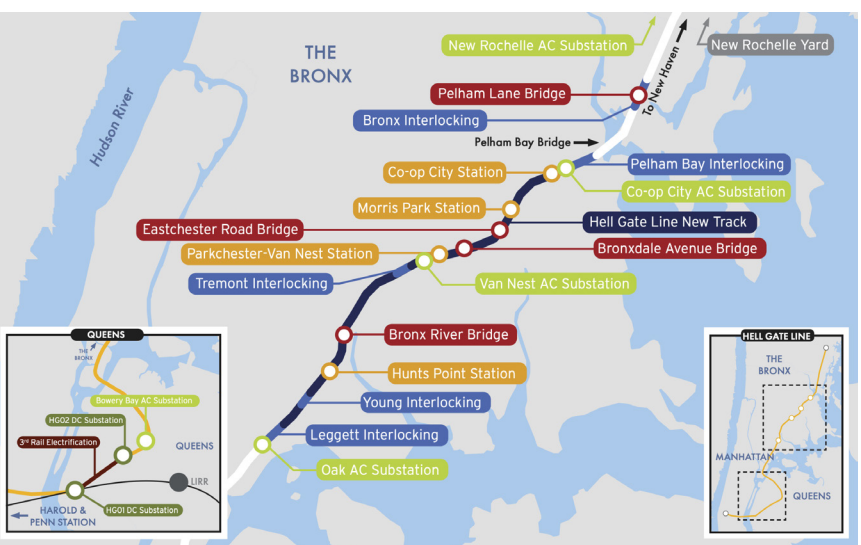
Above: Map of Penn Station Access Project elements, including 19 miles of track work, 4 bridge rehabilitations, 4 new interlockings, 1 reconfigured interlocking, and 5 new and 2 upgraded substations.