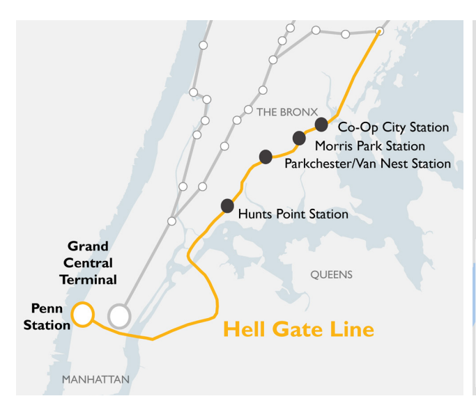
Above: Map of Penn Station Access Project corridor in relation to existing Metro-North network

The project will use Amtrak's existing Hell Gate Line to access Penn Station, maximizing the potential of existing infrastructure, while minimizing impacts on the surrounding community. It will bring the Hell Gate Line into a state of good repair, improving reliability and on-time performance for intercity passengers.