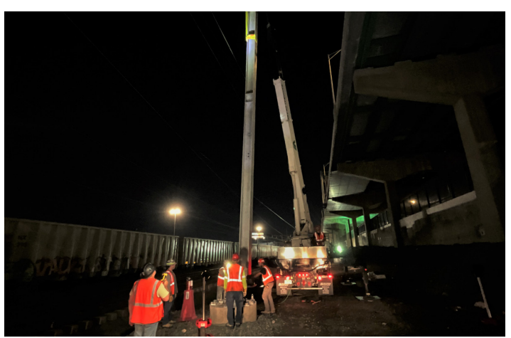
PSA construction workers erect OCS column portal July 2023